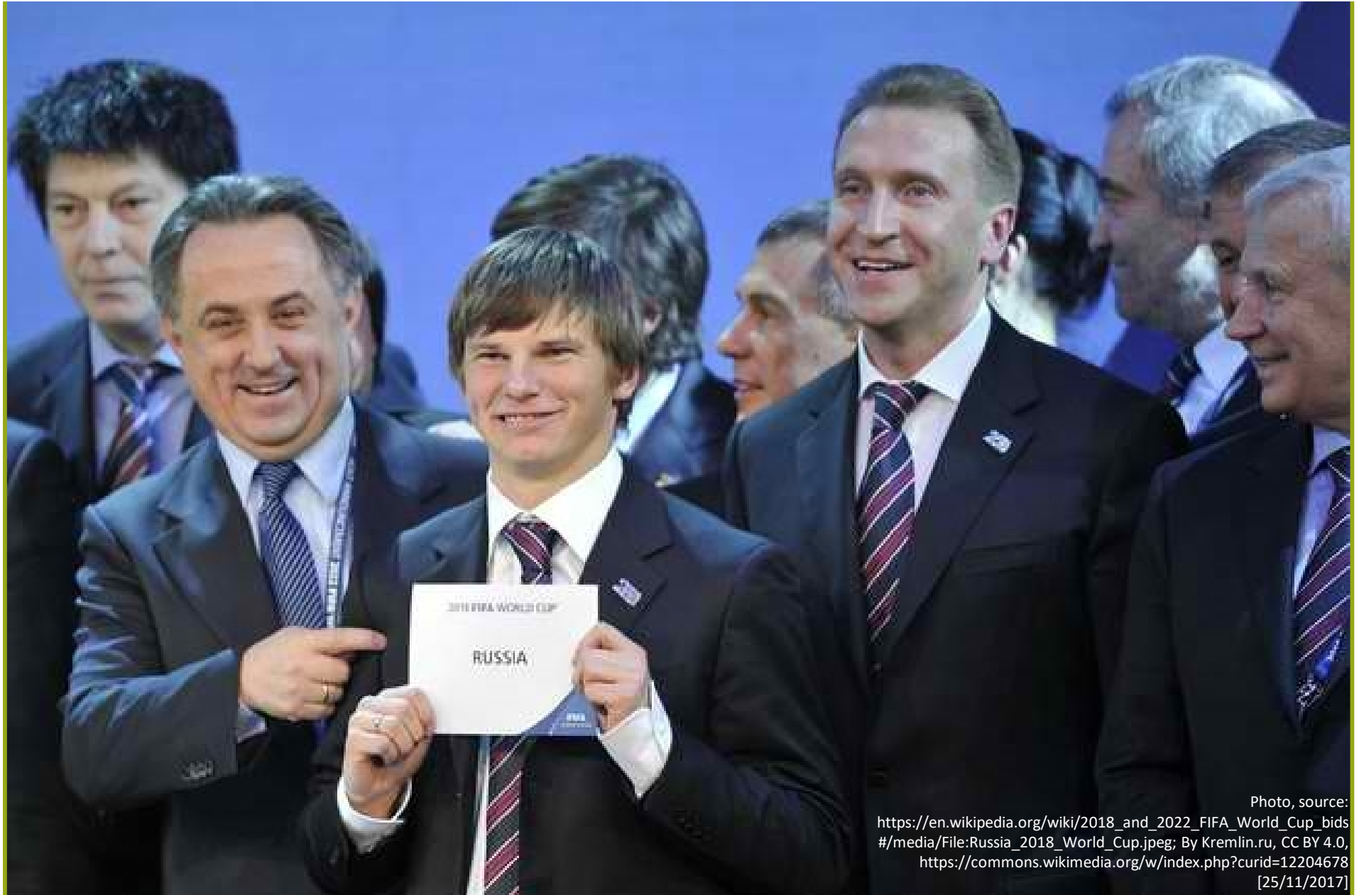
Photo, source: https://en.wikipedia.org/wiki/2018_and_2022_FIFA_World_Cup_bids#/media/File:Russia_2018_World_Cup.jpeg ; By Kremlin.ru, CC BY 4.0, https://commons.wikimedia.org/w/index.php?curid=12204678 [25/11/2017]