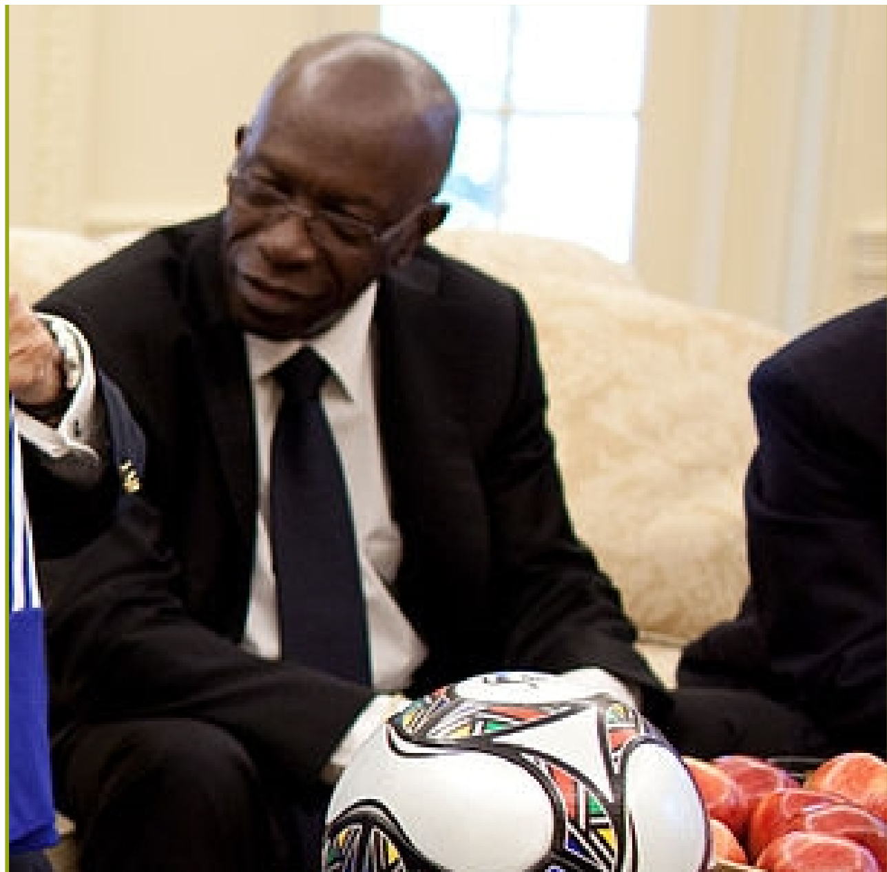
Jack Austin Warner, former President of CONCACAF