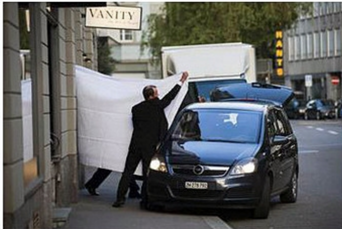
FIFA officials were escorted out behind sheets at the Baur au Lac hotel in Zurich.