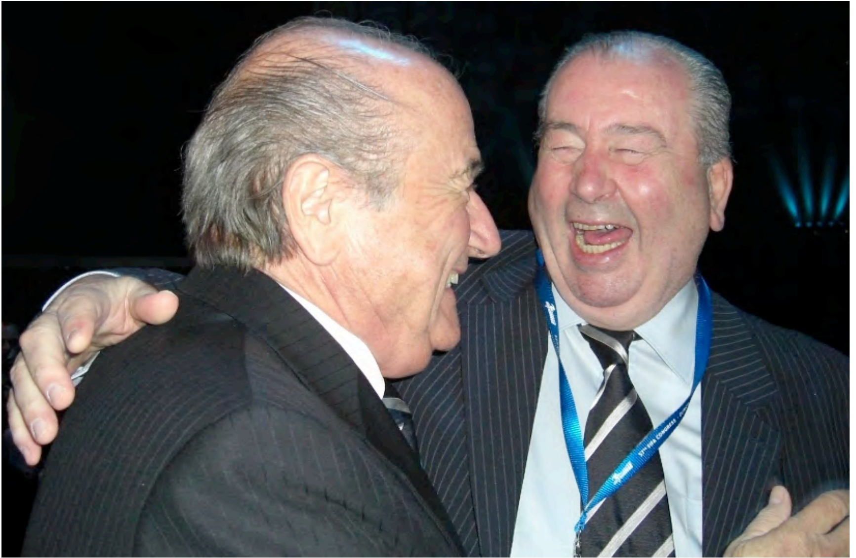
Mr Blatter, Don Julio Grondona