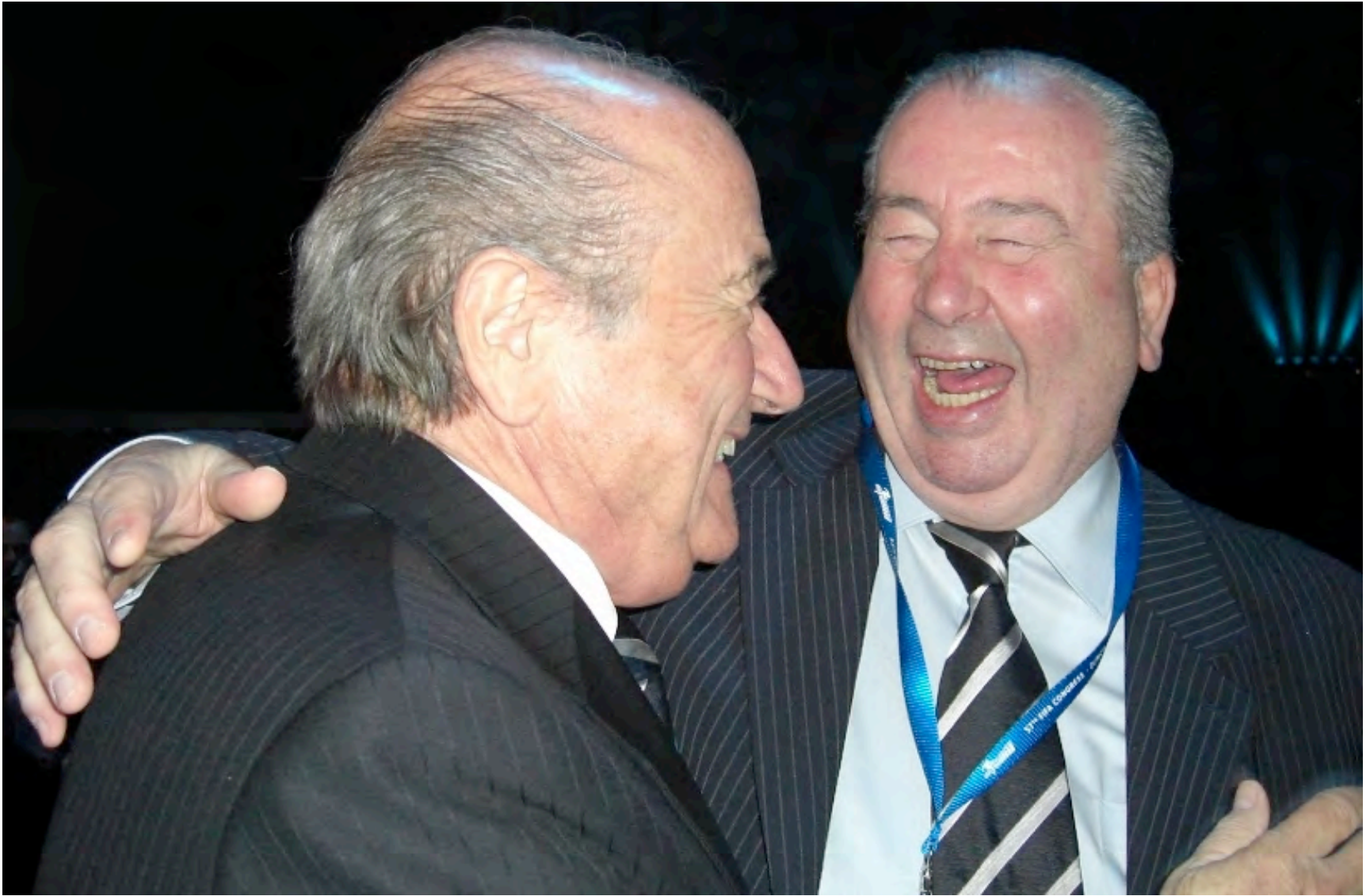
Mr Blatter, Don Julio Grondona